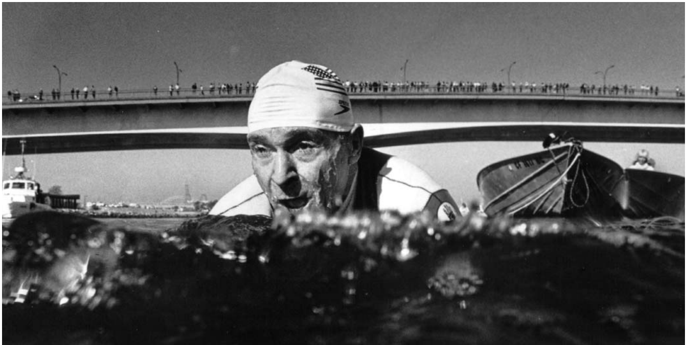
Jack LaLanne, on his 70th birthday, pulling 70 boats with 70 people for a mile and a half with his feet and hands tied.

LALANNE: When I turned 40, I was Mr. America and weight training intensely. But believe it or not, some people were still telling me I was too muscle bound and limited in what I could do physically. I also realized I was finally over the hump. I wanted to find something to prove those naysayers wrong, and challenge myself physically. I started thinking about the fact that no one ever successfully escaped