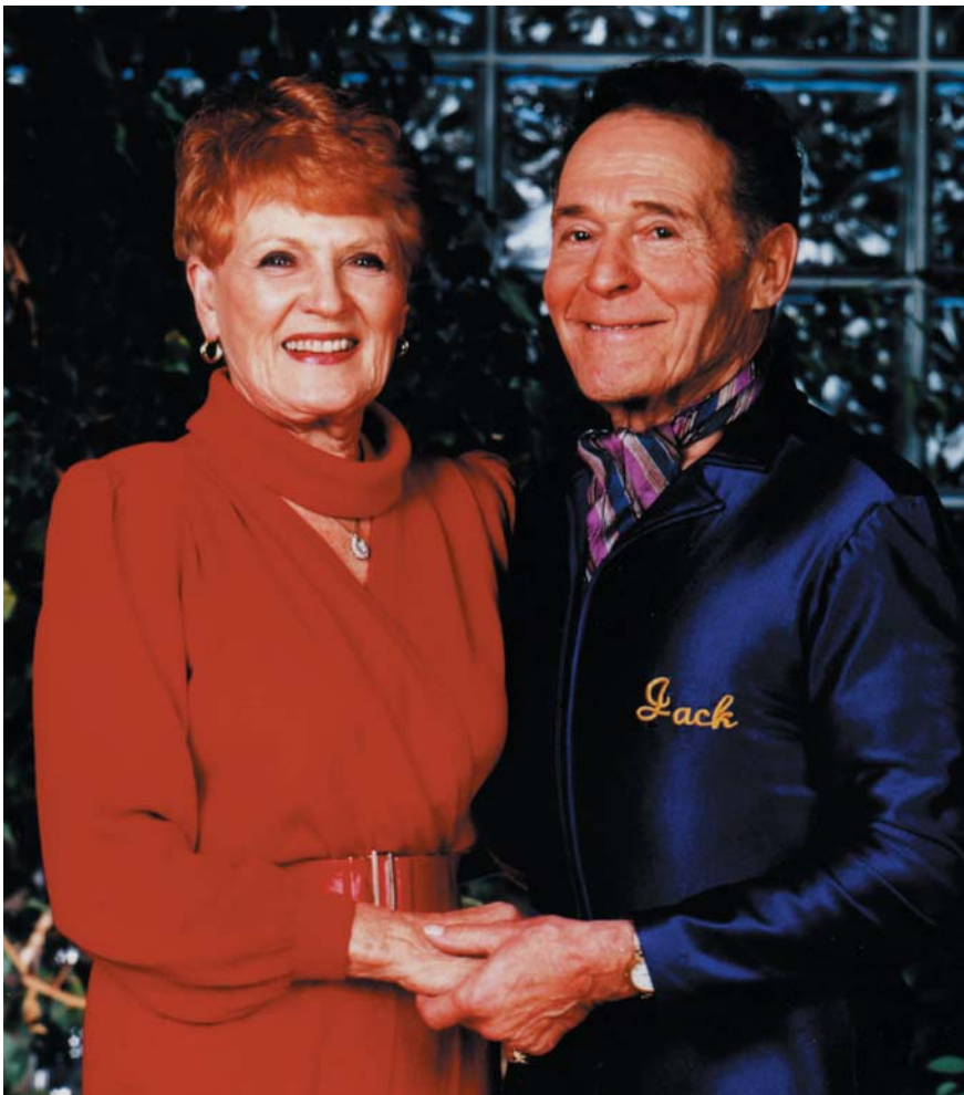
Jack and his wife Elaine LaLanne travel throughout the world, lecturing and inspiring people to greater heights through exercise and nutrition.

PUT THEM TOGETHER AND YOU'VE GOT A KINGDOM."